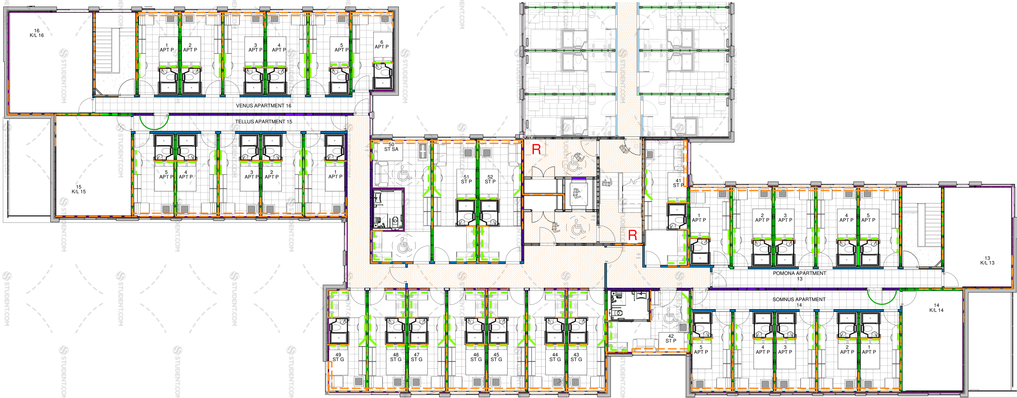
1 SI Level 2 MARKETING PLAN 1 : 125